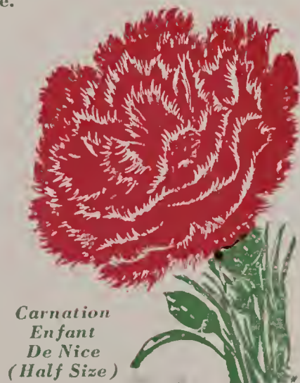
Carnation Enfant De Nice (Half Size)

MORNING GLORY - ROSE MARIE. Beautiful deep rose of double and semi-double Form. The finest Morning Glory. Per Pkt., 10c.